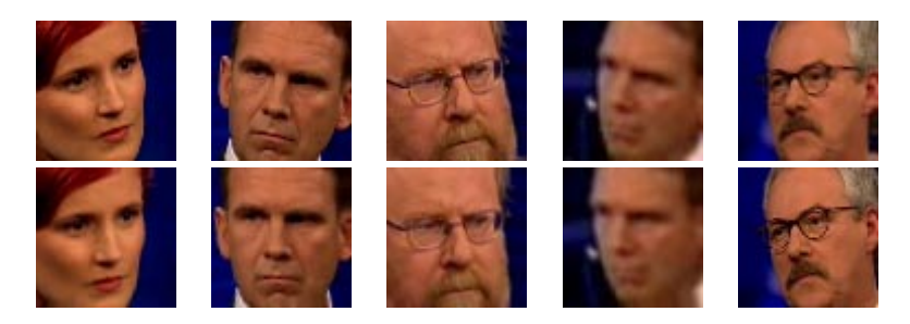
Figure 4, upper row: Examples of leant heads, leading to in-plane rotation of the face. The lower row shows the same faces after they have been rotated back to an upright position by Videana's face recognition system using the detected position of the eye region. This step is important for a later comparison of two faces.

After a first grouping phase, a further analysis is applied to persons who appeared in more than a predefined minimum number of shots. This analysis aims at finding face features that best discriminate this face group from the other groups. Finally, the classification is re-run using these group specific features. Preliminary results for the recognition of frontal faces are very promising. In particular, the correction of in-plane rotation and facial feature selection significantly improve the results: Based on a TV discussion sample, sufficiently large clusters could be built for 5 of the 6 appearing persons that could be used to represent a person and learn the specific facial features. The recall rate was 84% at 94% precision for the clustering (i.e. only 6% of the persons associated with a group did not conform to the group's main identity). The baseline system reached only a recall rate of 71% for the same precision score.