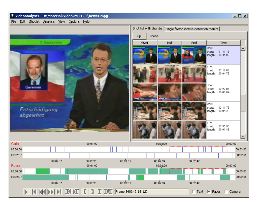
Figure 1: The main window of Videana . On the left side, there is a window for playing a video. There are two timelines at the bottom which visualize the analysis results for the temporal segmentation of the video into shots as well as for face detections. The vertical lines in the Cuts timeline represent cuts (abrupt shot changes), the colored areas in the timeline Faces mark the sequences where a frontal face appears. Two timelines are presented for each kind of event: the upper one represents the total duration of a video, whereas the lower one zooms into a certain time period which can be selected in the upper timeline and is surrounded by a red rectangle. Further timelines are displayed in case that the corresponding analysis results or user annotations are available for the related events of camera motion, superimposed text or audio events. On the right side, the temporal segmentation is presented in another way. Single shots are represented by three frames (beginning, middle, and end frame of a shot). By a mouse click on an icon, the related video frame is accessible directly, while a double click starts playing the video from this position.

Up to now, the following automatic video content analysis algorithms are integrated in Videana : Shot boundary detection, text detection and recognition (video OCR: optical character recognition), estimation of camera motion, face detection, and audio segmentation which segments the video into sequences of silence, speech, music and background noise. Based on a plug-in approach, any type of analysis algorithm can be updated, exchanged or removed easily. The graphical user interface (GUI) of Videana allows users to play videos and to access particular video frames. Furthermore, the GUI allows users to manually correct erroneous analysis results.